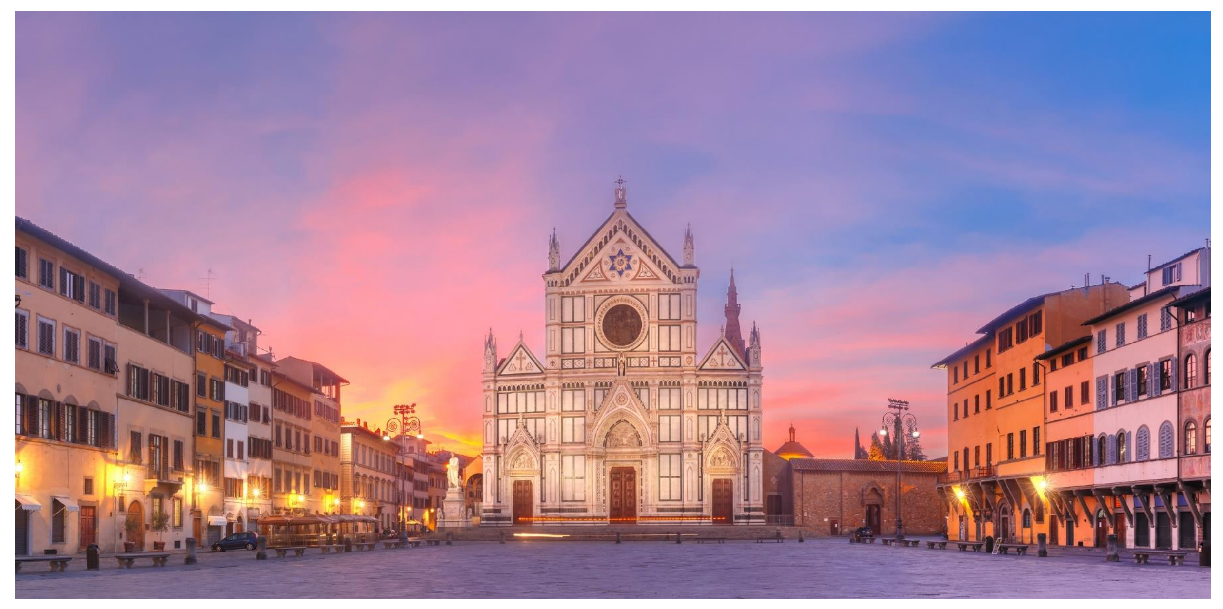
Basilica of Santa Croce at sunrise.